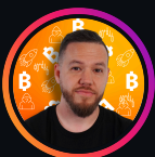
Bitcoin Jae @bitcoin.daily